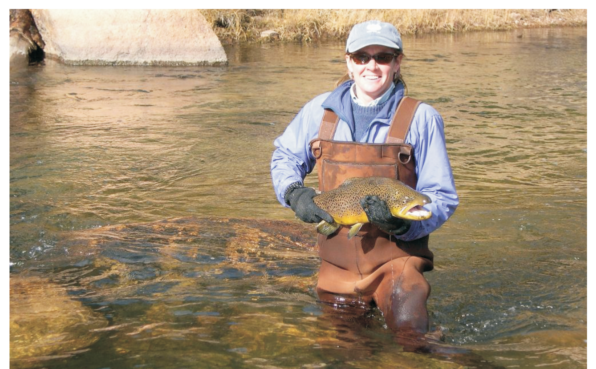
The fruits of a successful enhancement project!