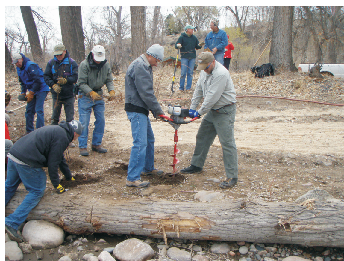
Trout Unlimited Volunteers planting bare-root stock willow on a log - toe / bank-full riparian bench structure. Arkansas River along the Canon City River Walk.