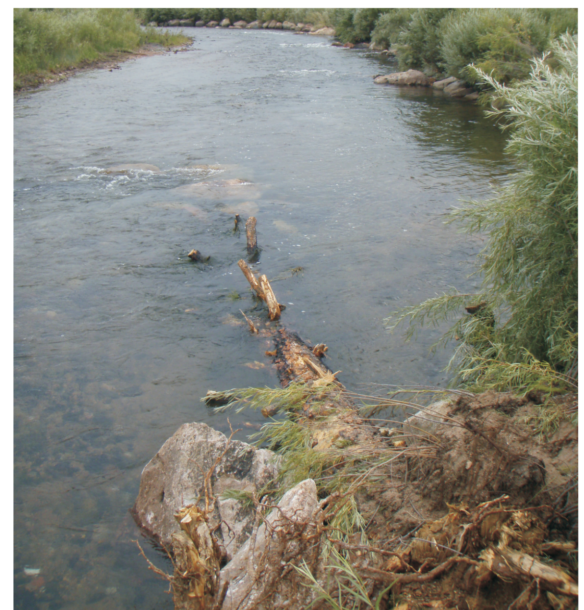
Log / Boulder J-Hook Vane for river bank protection and pocket water cover for trout. South Platte River in Park County, CO.