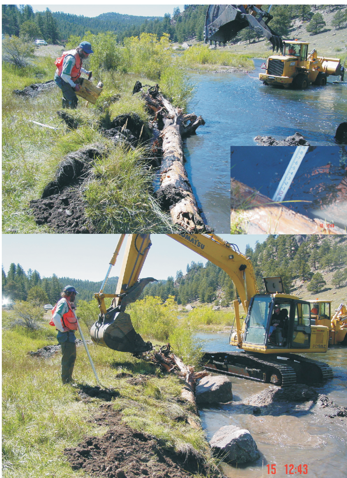
River Bank Cover "LUNKER" Structures constructed of Large Wood and Riparian Sedge.