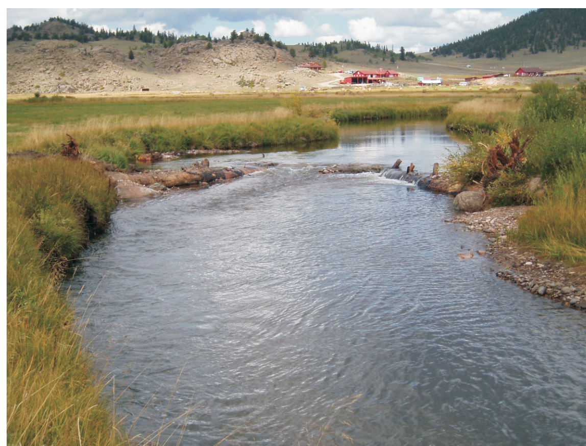
Double Log / Boulder Full Channel Cross Vanes to create new pool habitat. Tarryall River at the Eagle Rock Ranch.