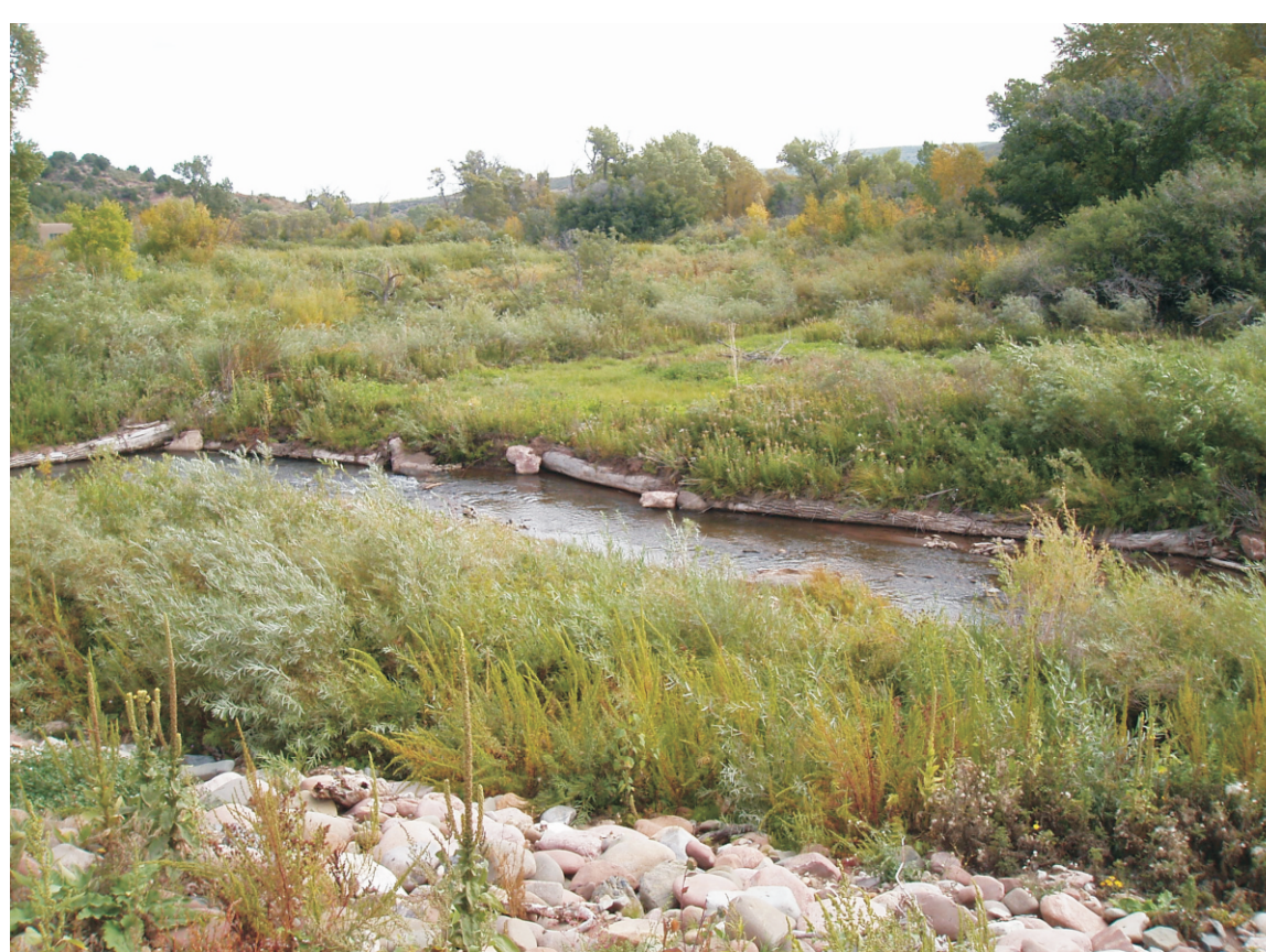
River bank stabilization using log toe riparian bank full benching and sedge/willow mats. Cuchara River near La Veta, CO.