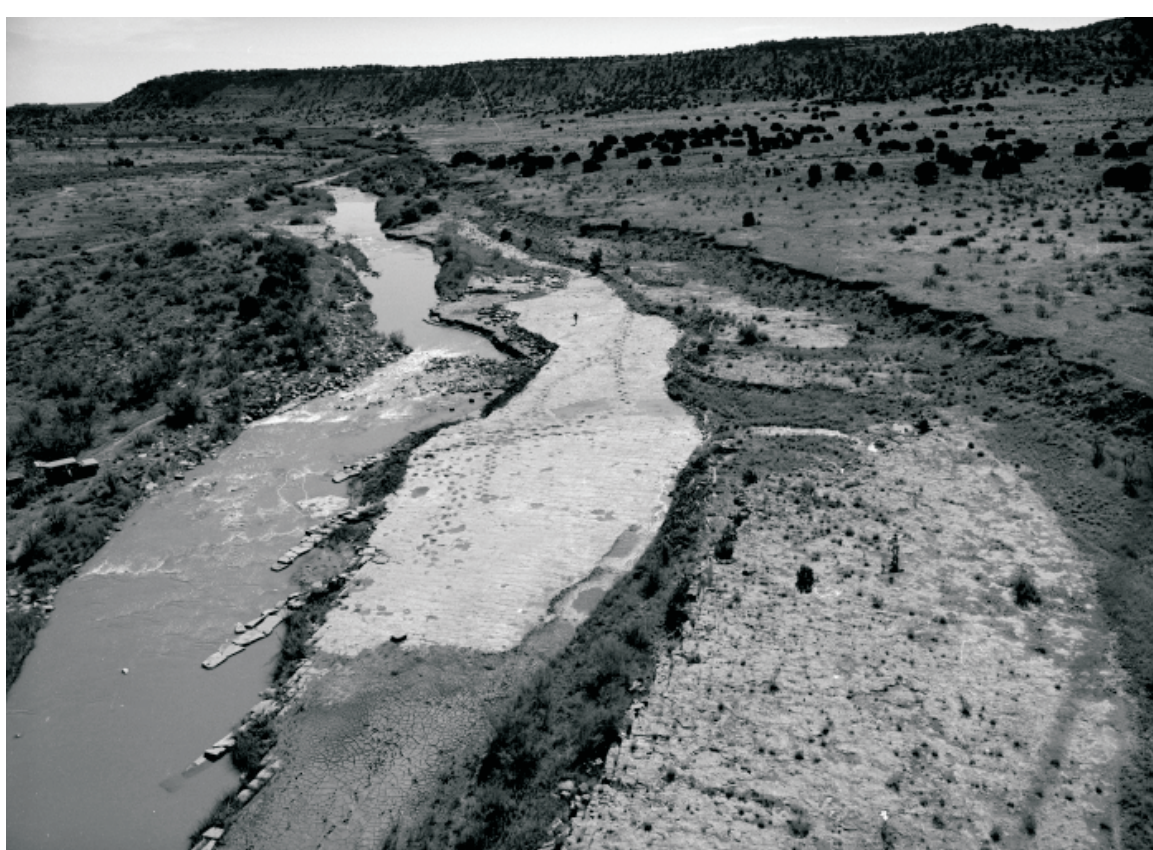
Boulder Rock Vanes - Purgatoire River Dinosaur Trackway

The photos below show some of the techniques that may be employed to improve holding cover, provide velocity shelter, and increase habitat complexity along our river. This assessment is being funded by a generous grant from the Trout Unlimited Embrace-A-Stream Program, and a Leo Golumchek Grant from the Colorado Trout Unlimited Executive Director's Office.