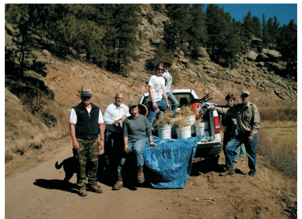
TU and CDOW volunteers transplanted sedges.